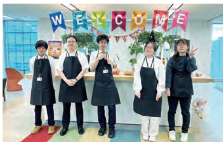
Dandies cafe service operated once a month at the Akihabara Office

With all employees inspiring each other, we will continue to strive to create a workplace where they respect their differences and improve each other.